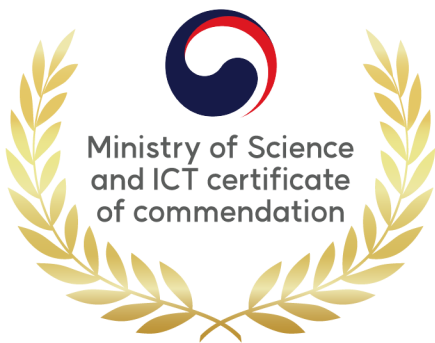
Fund policy contribution field