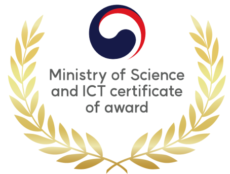
2022 AI Grand Challenge